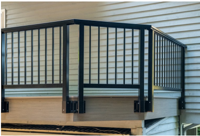
Aluminum Railings for Residential and Commercial Projects

AS&D is a Premier Manufacturer and Distributor of Aluminum Railing, Balcony, and Sunshade Systems