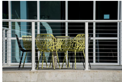
Stainless Steel Cable