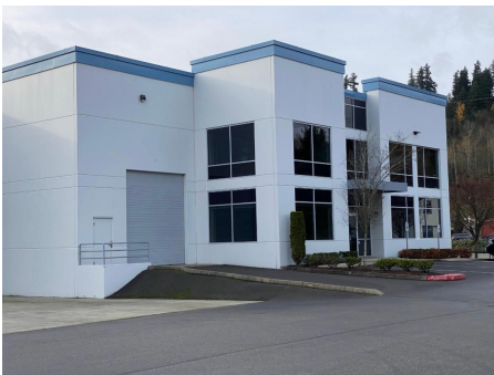
Sumner office facilities

PLEASE call BEFORE your WILL-CALL pick-up so you know which location has your will-call order. Avoid confusion and frustration - Give us a Call! 253-833-4343