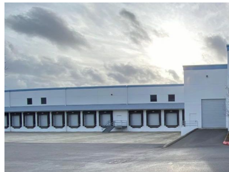
Multiple loading bays at the warehouse make will-call quick and easy

New Washington Address: American Structures and Design 1801 132nd Ave. E, Sumner, WA 98390 Phone: 253-833-4343