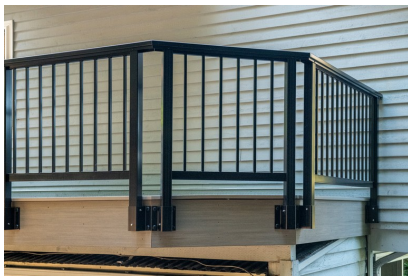
Aluminum Railings for Residential and Commercial Projects