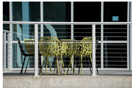
Stainless Steel Cable